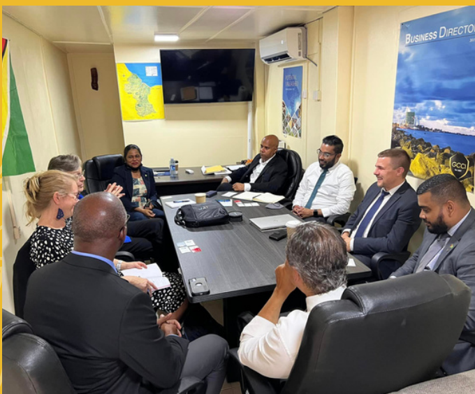
Meeting with Finland Ambassador

The meeting served as a follow-up to the “Doing Business with Finland” Seminar in 2020 which emerged as a result of a partnership between the Chamber and Finnpartnership.