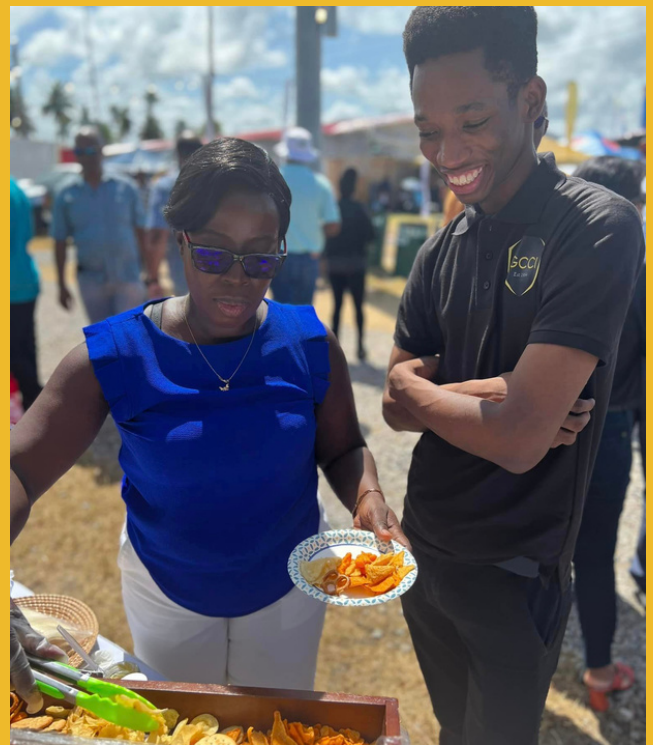
World Food Day Expo