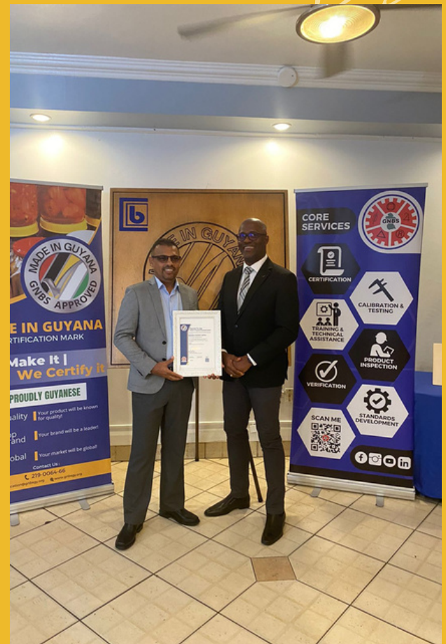
Guyana 'Certification' Ceremony