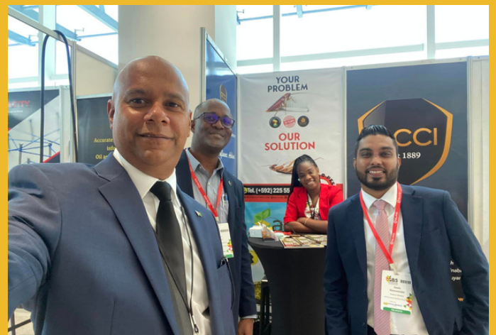
Guyana Basins Summit

This year, GBS was centered around ‘Responsibly Developing the Region’s Resources for a Prosperous and Sustainable Future’.