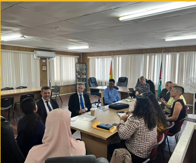
Business to Business Session