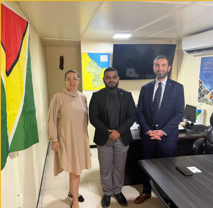
Meeting with EU Delegates