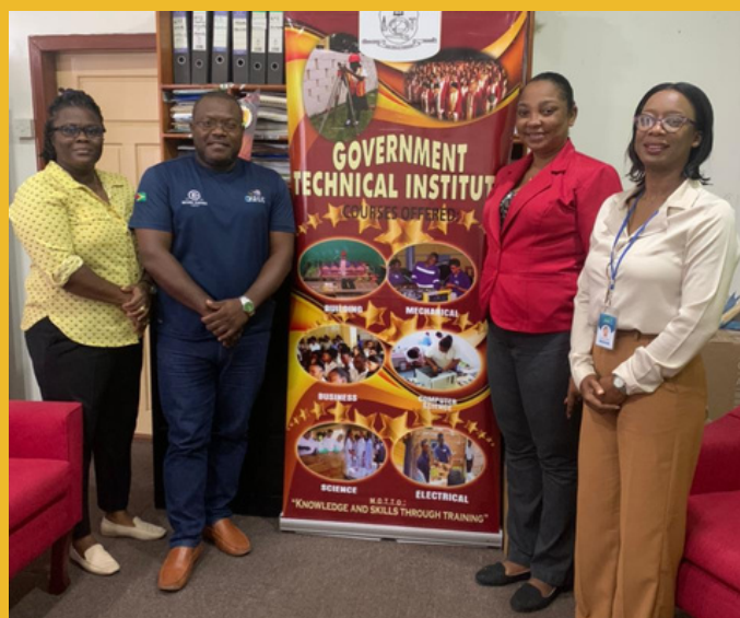
Meeting with GTI