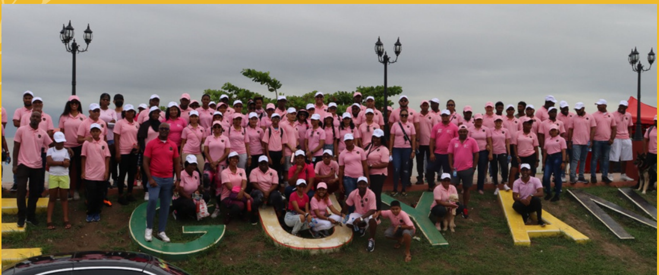
GCCI Breast Cancer Awareness Walk

The Chamber plans to add the Awareness walk to its annual calendar of events.