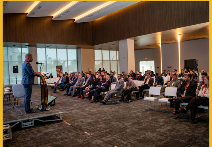
Guyana Basins Summit

The Georgetown Chamber of Commerce and Industry (GCCI) was the lead partner for the event with organizational support from Mayson Blackhouse Guyana, Sagacity Inc., and international marketing company, Global Event Partners. The Principal Partner was Digicel Business.