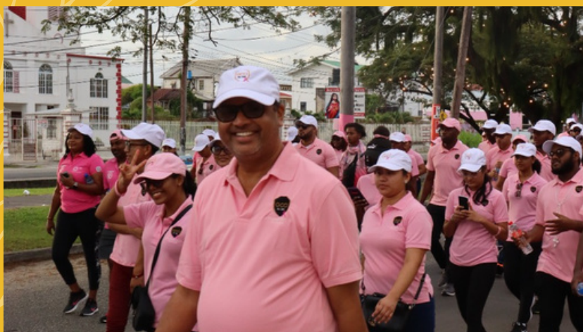
GCCI Breast Cancer Awareness Walk