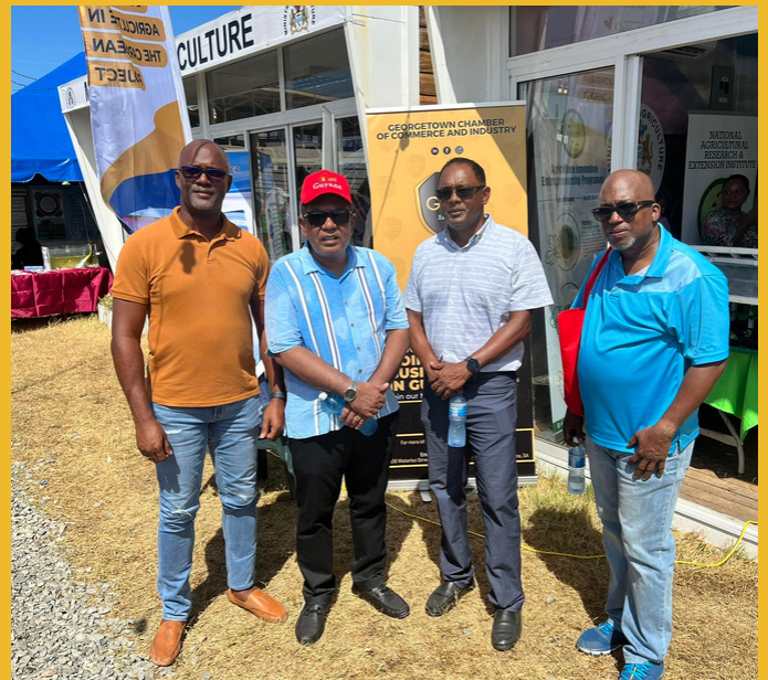
World Food Day Expo

Come out for a time of food sampling, novelty games and more. See you at the Expo!