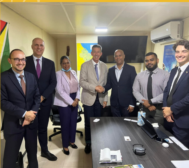
Meeting with French Delegation