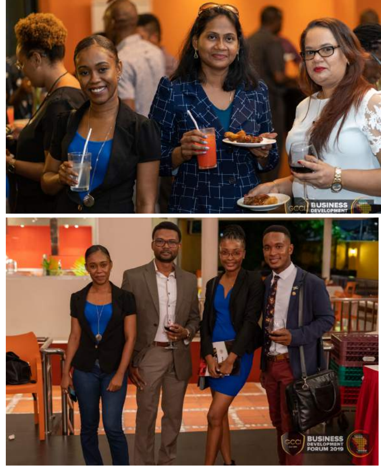
More scenes from the Cocktail Event