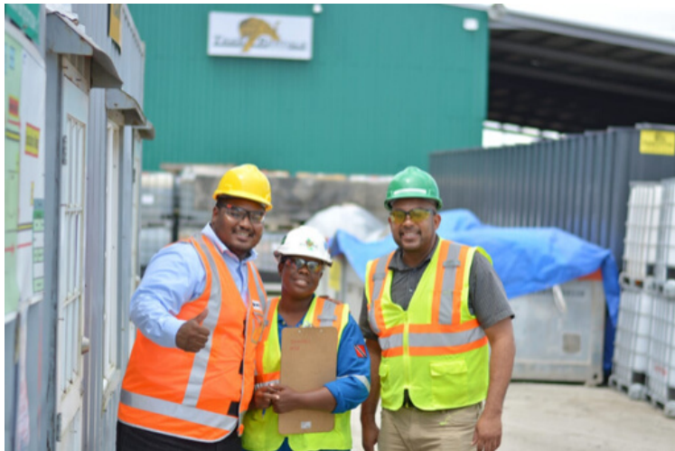
CEO of Massiah Capital on a PR project with a client within the oil and gas industry in Guyana