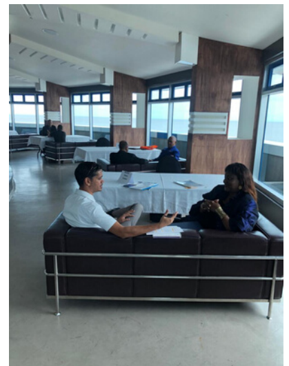
Members of the GCCI and JCC partakes in B-2-B sessions