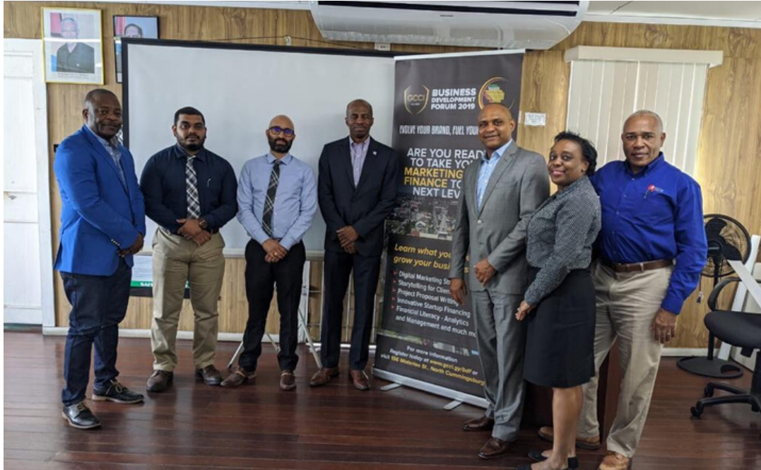
President of the GCCI meets with President of the JCC and other members of the traveling delegation