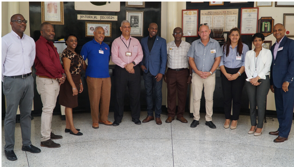
The JCC during their courtesy tour at Bank D.I.H