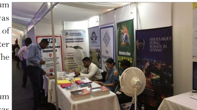
GCCI Booth at GIPEX

ment Departments working to make Guyana a favorable & Pro Business Destination, a prerequisite for boosting economic activities and achieving development objectives.