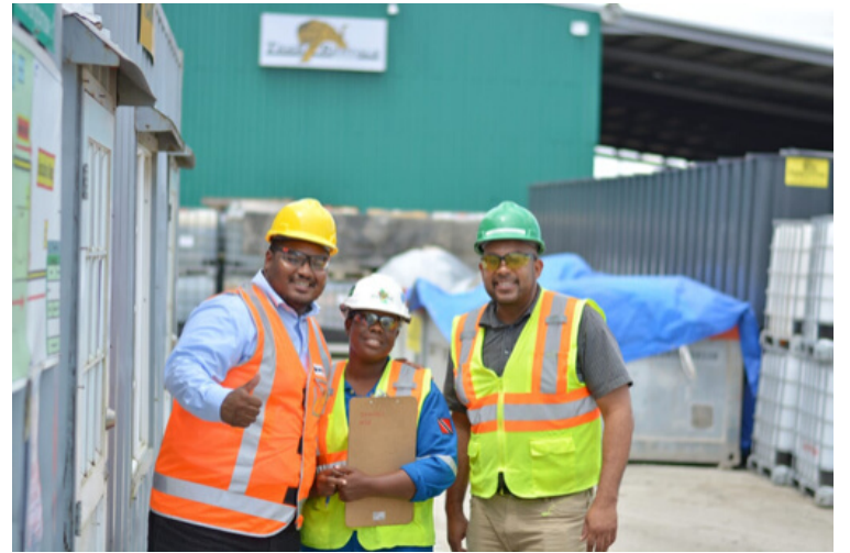
CEO of Massiah Capital on a PR project with a client within the oil and gas industry in Guyana