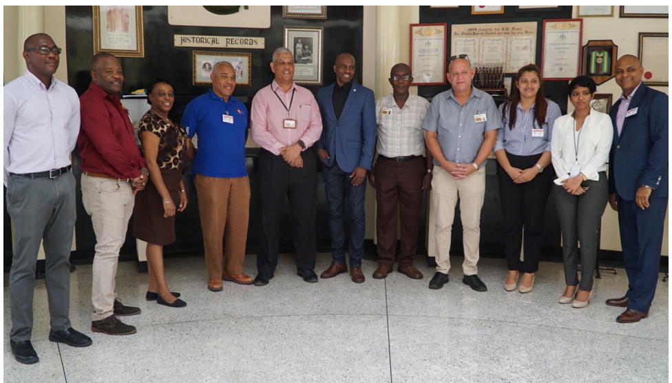
The JCC during their courtesy tour at Bank D.I.H