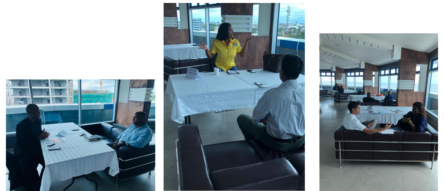
Members of the GCCI and JCC partakes in B-2-B sessions

President of the GCCI meets with President of the JCC and other members of the traveling delegation